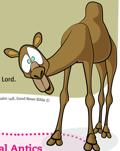
Bible story taken from Psalm 148, Good News Bible ©

Praise the Lord! Praise him, sun and moon; Praise him, shining stars; Praise him, highest heavens; Praise him, hills and mountains, Fruit trees and forests; All animals, tame and wild, Reptiles and birds. Let them all praise the name of the Lord.